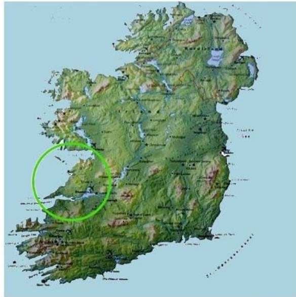
Figure 1: Map of Ireland highlighting County Clare (West Clare, 2021)

As the aim of this paper will be to determine the attitudes towards CNT by key tourism providers in County Clare, five Research Questions (RQ) have been identified, which should be met to fulfil this aim: