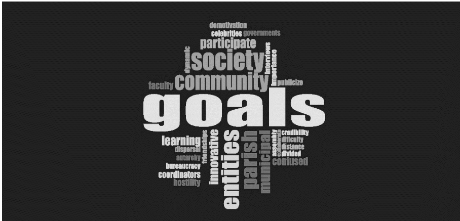
Figure 1. Challenges categorization. Originally published in Branquinho et al. (2018). Image 1. Word cloud of the individual interviews

empowerment and the weak participation of some elements; the collaboration of some teachers and some local authorities to receive young people; and the bureaucracy to develop a project, the lack of support from the community and some politicians and teachers as threats to participation.