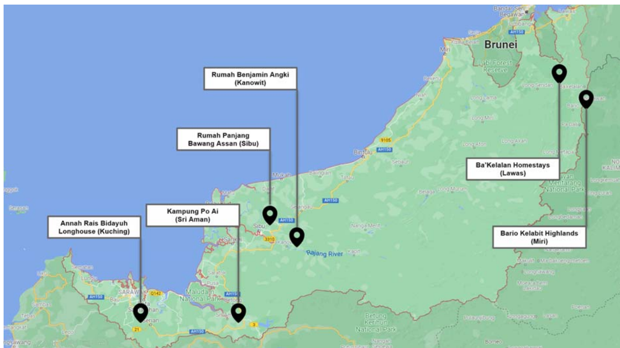
Figure 2: The Location of the Research Sites.

Quantitative data was collected through the distribution of questionnaires, and the data was analysed using a non-probability sampling technique. A purposive sampling technique was used to select respondents aged 18 years and older, regardless of whether they were domestic or international tourists, visiting the six rural tourism destinations in Sarawak. Annah Rais Bidayuh Longhouse, Kampung Po Ai Melugu, Rumah Panjang Bawang Assan, Rumah Benjamin Angki, Bario Kelabit Highlands, and Ba'kelalan Homestay were used as study locations (see Figure 2). One reason for focusing on rural tourism destinations in Sarawak is due to the fact that rural tourism destinations within the state have become increasingly interesting to tourists because of the region's unique combination of natural, cultural, and adventure tourism. If the study in Sarawak is successful, tourism-related activities may provide a lucrative alternative source of income for the local communities. The success of this model could also have global implications for rural tourism destinations.