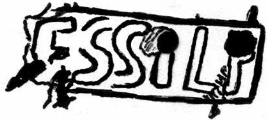
Fig. 3: Drawings of the moulded inscriptions: a) ingot from Bajo de Dentro (Museo Naval, Madrid); b) of the damaged ingot from photo Inv. n°. A-8 N° 922. P. Rothenhoefer/J. Hollaender.

Indeed, a close view on the photo of the damaged ingot (Inv. n° A-8 N° 922) allows to suggest another formular (fig. 3b): The first letter after the cut is damaged at the bottom, it must be an E or F. It is followed by double S, after that the lower part of an I (the upper part destroyed by a drilling hole); the next letter clearly is L, followed by a vertical line. That means: [- - -]FSSILI or [- - -]JESSILI. The latter reading can be compared with names already documented on lead ingots: C MESSI L F = C(aii) Messi(i) L(ucii) f(iliu) on one ingot found in Italy at Savignano del Rubicone (province of Forlì-Cesena) (CIL 11, 6722, 13; Besnier, 1921, 109 and 127 n°. 61; Davies 1935, 109 note 7; Ramallo Asensio, Berrocal Capparos, 1994, 125; Domergue, 1988, 213 tab. 1) and on another ingot found in the wreck Bajo de Dentro at Cabo de Palos (province of Murcia), which is now kept in the Museo Naval in