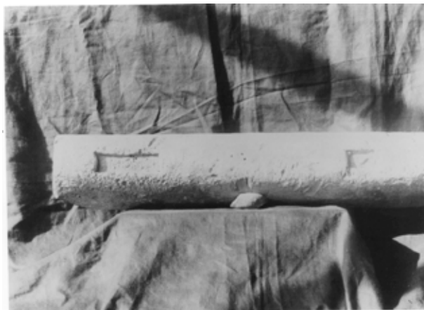
Fig. 2: Lead ingot found at the zona del Filón Norte at Minas de Riotinto (Inv. n.º. A-8 N.º 923).

Societ(at)is || mont(is or -ium) • ar- gent(iefodinarum) || Ilucr(onensium)