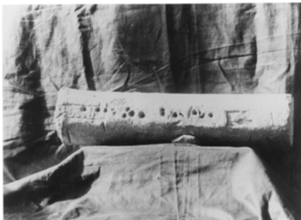
Fig. 1: Lead ingot, cut on the left, found at the zona del Filón Norte at Minas de Riotinto (Inv. n.º. A-8 N.º 922). Archivo Histórico Minero de Fundación Río Tinto.

1 Furthermore two ingots, now lost, „con sello de Carthago Nova“ (Pérez Macías, Delgado Domínguez, 2011, 70). These two ingots with the typical round shaped form of Republican lead ingots produced at the mines near Cartagena had been found at Riotinto in a slag pile. The correct reading of the stamp is Nova Carthago (Rickard, 1926/1927, 333; CILA I 46). – The wrong reading also in Domergue, 1966, 65 and in Millán, 1989, 126-127.